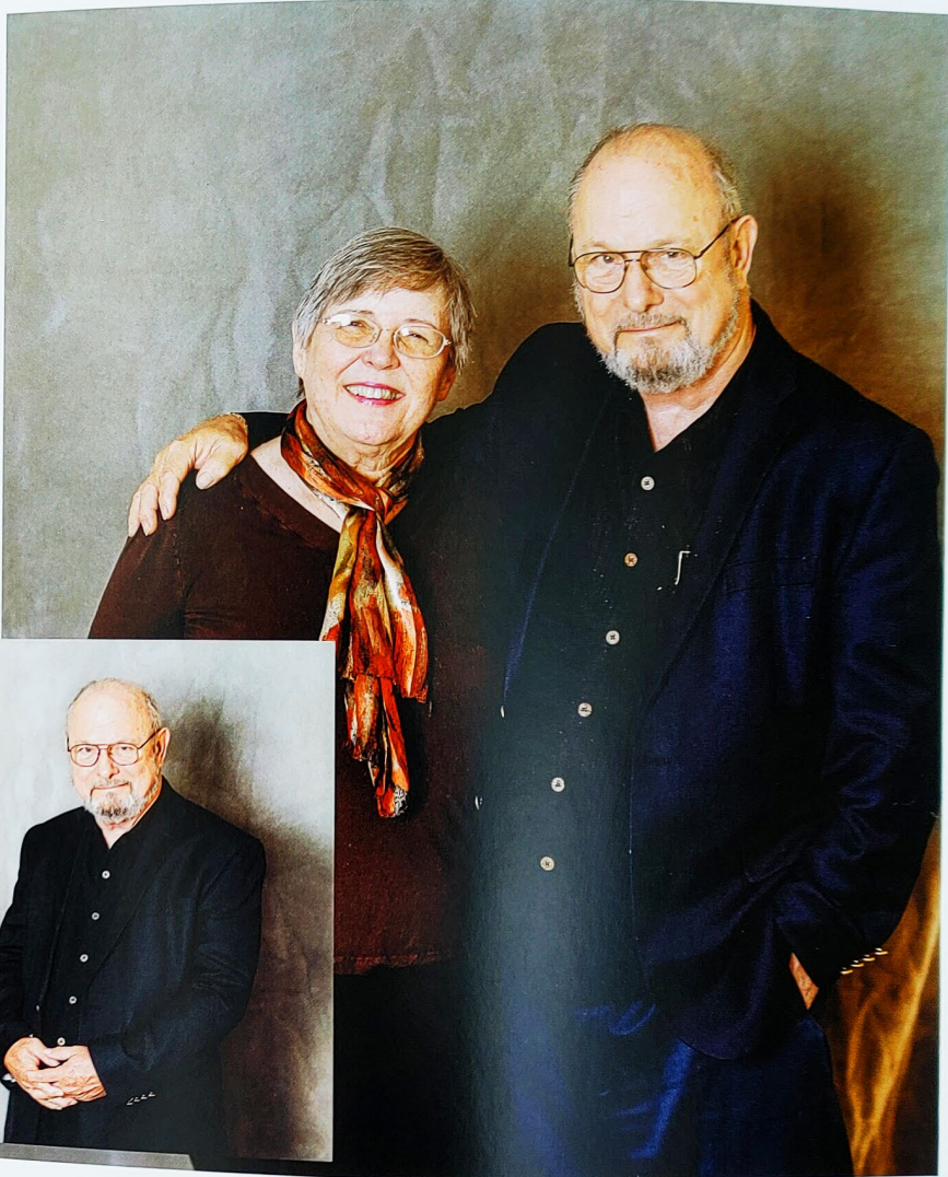
WorldBuilders of Science Fiction & Fantasy